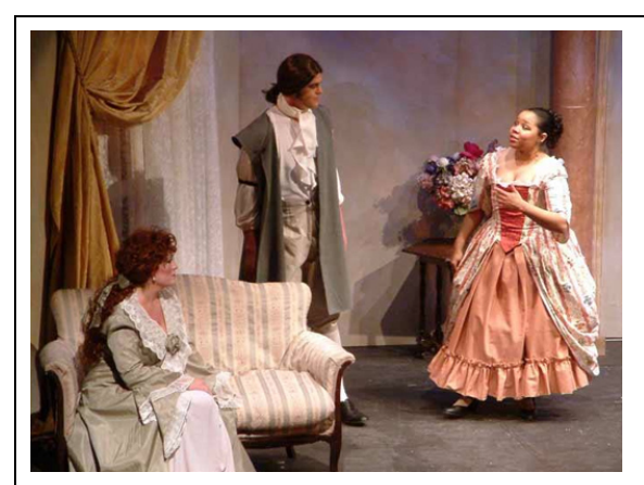
Wednesday, September 25, 2013 Arbor Opera Theater